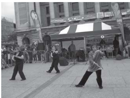
Tai Chi in Market Square

So far, other than workshops to individual groups, we have participated in the Volunteering Event at the Market Square on 7 th July, where over a hundred people visited our stall, most of whom tried the Chinese brushes. We were also at the Beeston Carnival and Mellor's Lodge Summer Fair. With the quality of the project, ChACE has been short-listed as one of the top ten small grant projects of the year by NCF.