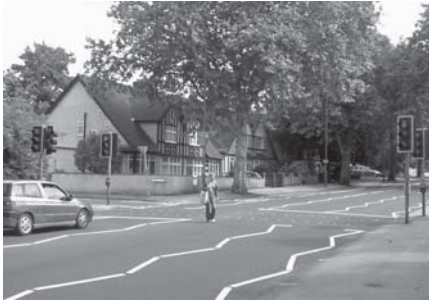
Derby Road Health Centre crossing with no central reservation or wide pavements.