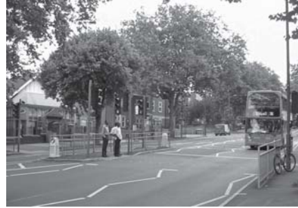
Savoy Cinema crossing with central reservation.