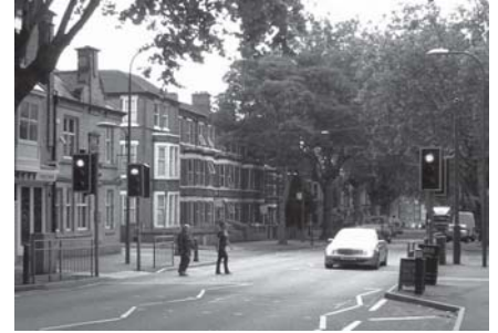
Lenton Boulevard crossing with pavement extensions.

The crossing outside the Derby Road Health Centre may well be the worst pedestrian crossing in Nottingham. All too often cars turning right out of Johnson Road, beside the health centre, cut across oncoming city bound traffic and have to cross the lights on red to avoid an accident. One day someone will be killed.